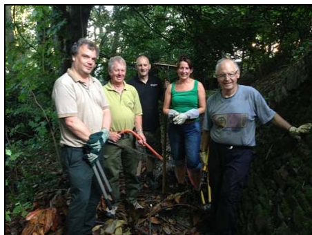
East Hill Woods Volunteers

Over the next month a few tasks were carried out in the woods which were well attended by volunteers from the village and also from another local group, 10 villages. The tasks involved improving access to the woods by clearing the paths and removing some young trees which had sprang up around the entrance. Holly and thorns were cut back and the place given a general tidy. We also tackled the very overgrown path running down from the station into the village past the woods.